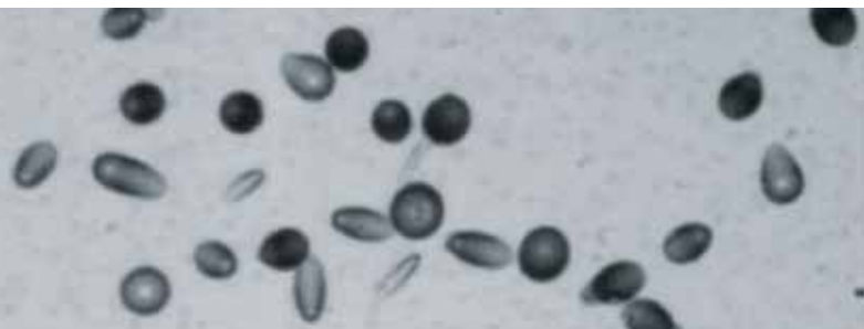
Microphotograph of particle tracks in CR-39 material from 222 Rn decay.

This high level of visual detail—along with accuracy, simplicity and cost-effectiveness—is why SSNTDs made from CR-39® material are leaving their own mark on the industry.